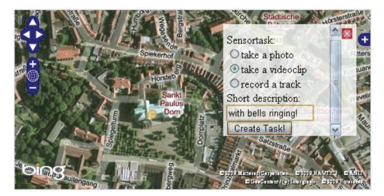
Figure 4: Requesting a sensor task

A registered user can submit a new sensor task. Besides a general description, the task's location can be defined by using the map (see Figure 4). Further, the task description may contain special instructions (e.g., "no people on the photo, please"). In future, advanced user interfaces should also provide menu items that are designed to specify minimum quality needs, such as minimum resolution or frames per second. As a simple example of a task, a requester could ask the community to provide him/her a video of the "Sankt Paulus Dom" in Münster, Germany when its bells are ringing.