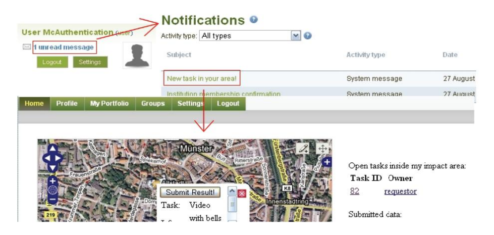
Figure 5: "New task in your area!"-Notification

Then, a user may answer to such a task to help the requester. In the above outlined example, a human sensor would videotape the dome and upload the data to a video sharing site (e.g., YouTube) to submit the link to this video to the human sensor web portal. The task requester is notified about the submission and can access the recorded video.