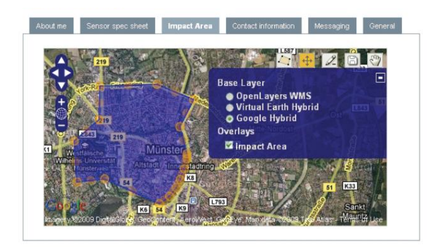
Figure 3: Edit Profile, Impact Area

A registered user can submit a new sensor task. Besides a general description, the task's location can be defined by using the map (see Figure 4). Further, the task description may contain special instructions (e.g., "no people on the photo, please"). In future, advanced user interfaces should also provide menu items that are designed to specify minimum quality needs, such as minimum resolution or frames per second. As a simple example of a task, a requester could ask the community to provide him/her a video of the "Sankt Paulus Dom" in Münster, Germany when its bells are ringing.